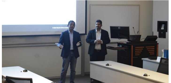
1. A still from the Session