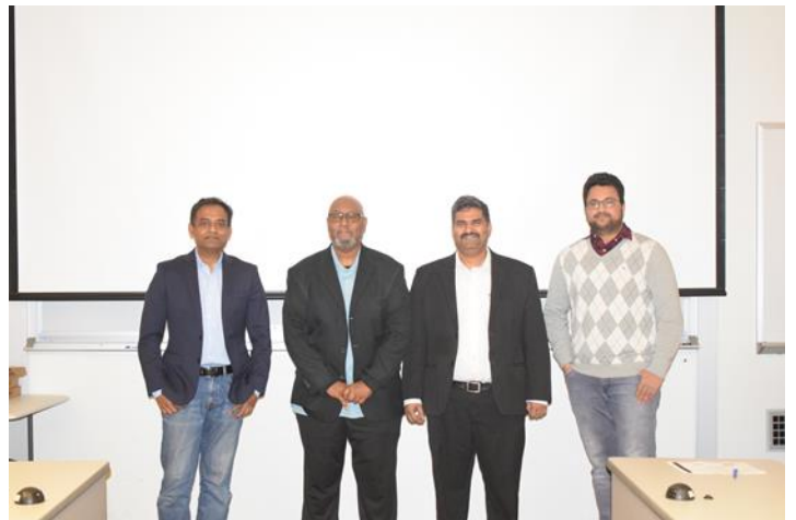
2. Professor with the Guests