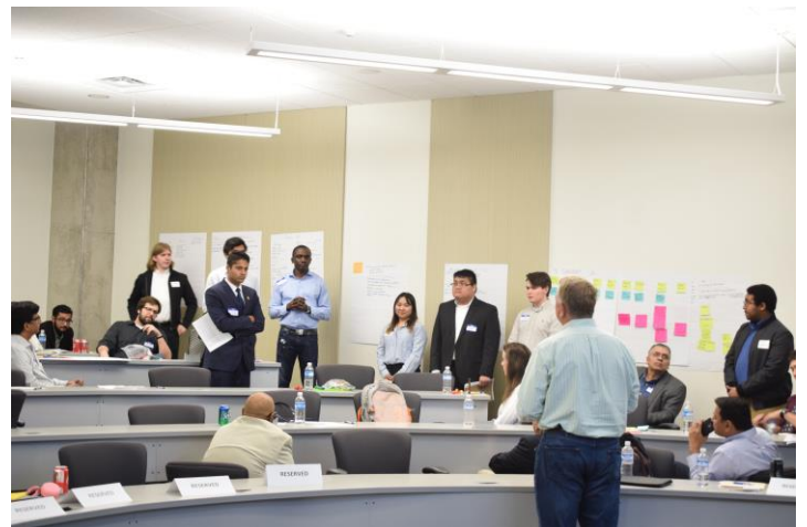
1. A still from the Session

The Dean of The University of Texas at Dallas graced the event with their presence. Delicious pizzas were served to everyone at the event.