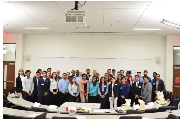
2. Guests along with the participants