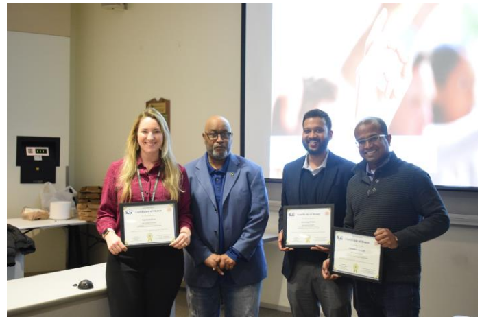
2. Professor presenting the Certificate of Honor